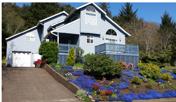
Sunshine and blue Lithodora