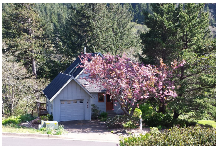
Flowering cherry (or is it plum?)